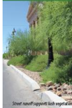
Street runoff supports lush vegetation.