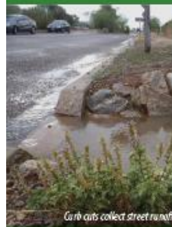
Curb cuts collect street runoff.

When rain falls, stormwater flows off our yards and into our streets, down our storm drains and into our desert washes. Along the way, the running water can pick up a variety of contaminants.